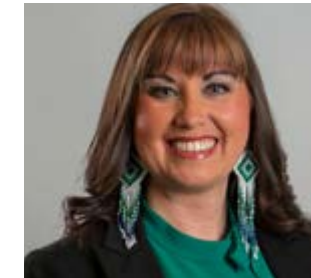
2021 Melvane D. Hardee Dissertation of the Year Winner

“ This award is one of the highlights of my career thus far as a first-gen Cherokee and Muscogee womxn, as it extends much further than just myself and this heart work – it is an honor for my family, my tribal communities, and my participants. This recognition affirms our work as Indigenous scholars in the academy that was not built for us, and elevates our epistemologies and methodologies in these spaces. Wado to the NASPA Foundation for this honor and support so that future generations of Indigenous students, scholars and researchers will continue to assert their worldviews in the academy and beyond.”