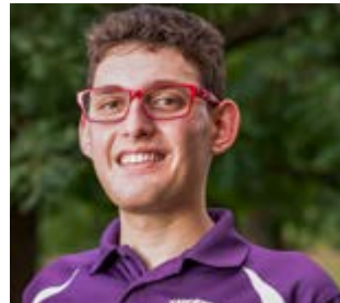
2021 Jim Rhatigan Fellowship Winner

“ Receiving the Rhatigan Fellowship was an amazing professional development opportunity for me. As a graduate student, having the chance to network with professionals in the field, attend educational sessions, and continue to be informed was truly a wonderful experience. My pre-conference workshop on equity in assessment was especially beneficial. I left the session with concrete methods to bring back to my campus to continue to advance assessment, evaluation, and research methods into a more diverse and inclusive tool. I am so incredibly thankful that I got the opportunity to attend the Virtual Conference. Despite all the challenges, I felt more connected and informed about the profession than I ever have before.”